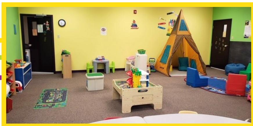
Tupper Street Family Resource Centre Child Space Upgrades