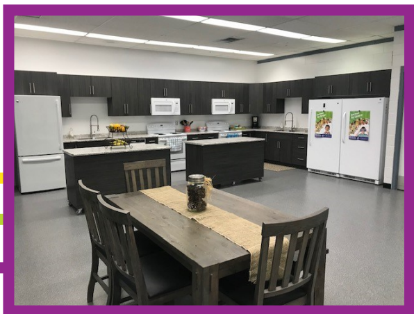
La Verendrye School Family Room