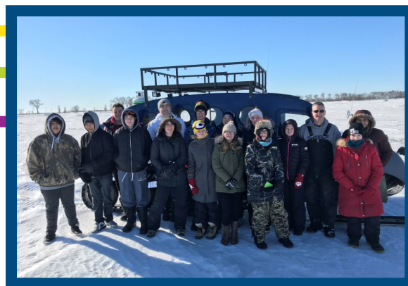
Portage Collegiate Institute Angling Club