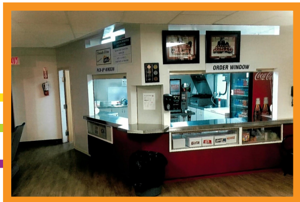
Oakville Rink Canteen Renovation