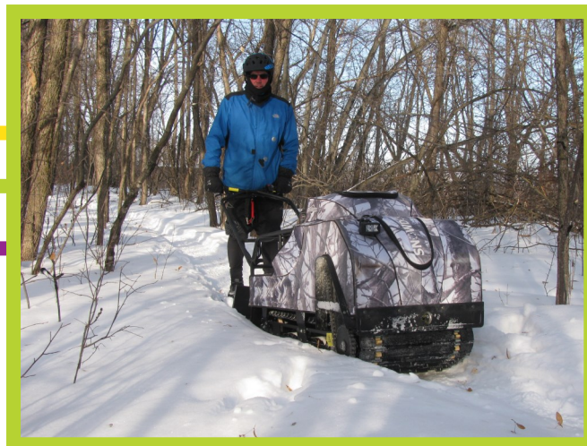
Junk Yard Dogs Cycling Club Trail Groomer