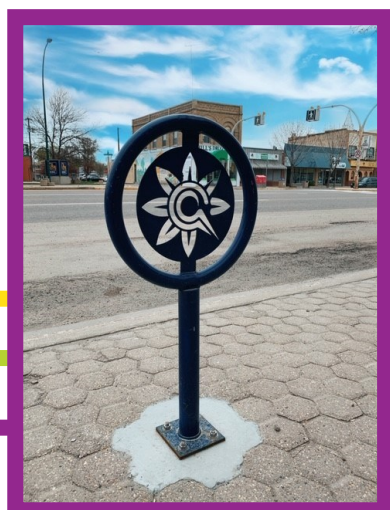
Portage Active Transportation Bike Racks